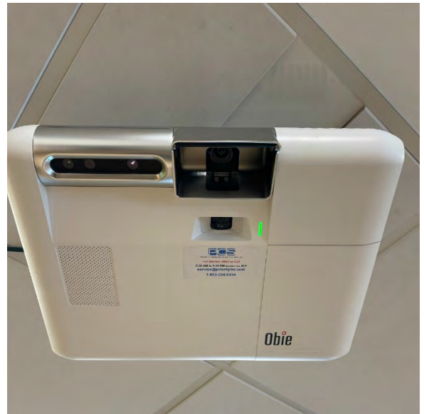
Obie projector on the ceiling