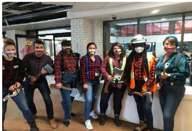
Life Enrichment Team at Halloween