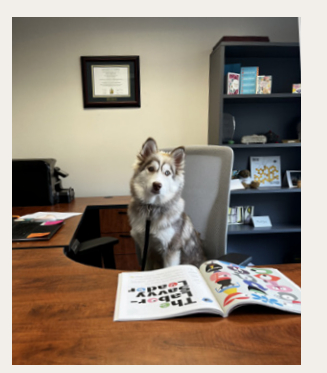
MESSAGE FROM Koda, CEO (Canine Executive Officer)

This feeling of accomplishment is a product of our supporters, as you will read about in the pages ahead. Without our donors, funders, sponsors and community partners, these beautiful spaces, programs, and activities would not be realized. Our Heart of Canterbury team, which is donor funded, ensure our social worker and chaplain can bring a level of comfort to residents and families as they navigate change or challenging circumstances. As we approach the 4th Annual Promise of Home Campaign, we know our donor family will stay in lockstep with our mission, and donate to provide safety, comfort, independence, and connection in support of meaningful lives for our seniors.