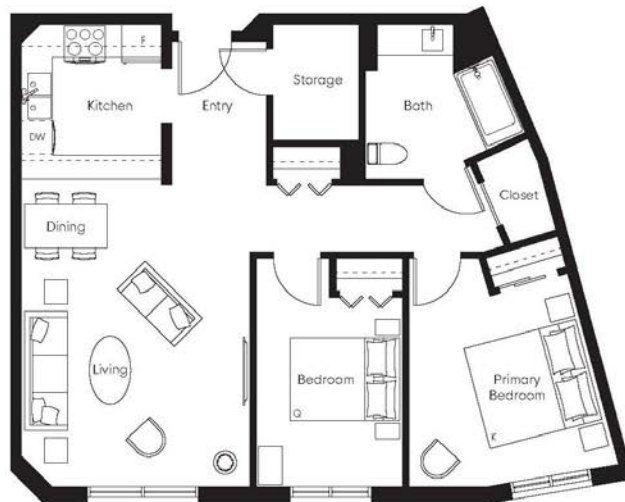
C | Typical 2 Bedroom Suite 868 sq ft