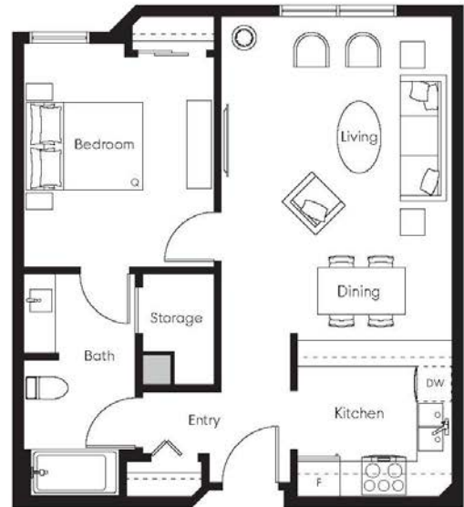
B | Typical 1 Bedroom Suite 642 sq ft