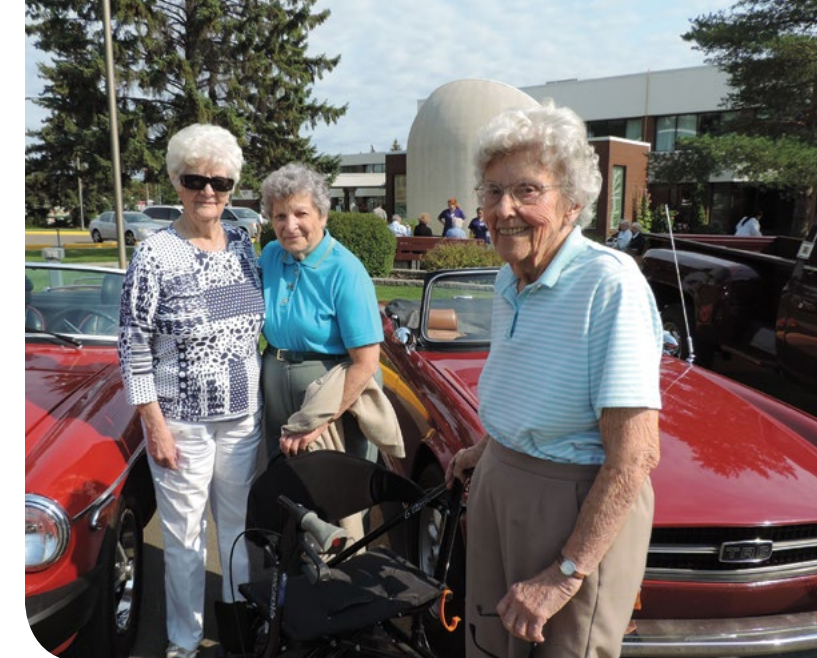
Residents enjoyed a trip back in time last July with a 50's car show onsite at Canterbury.

The new Community Outreach Program was initiated in 2015 with the addition of a geriatric social worker who will provide social, psychological, mental, emotional, spiritual and relationship support for Canterbury residents and their families with plans to expand services into the local community.