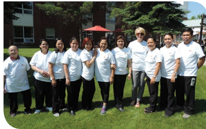
Fun was had by all at our staff barbeque!